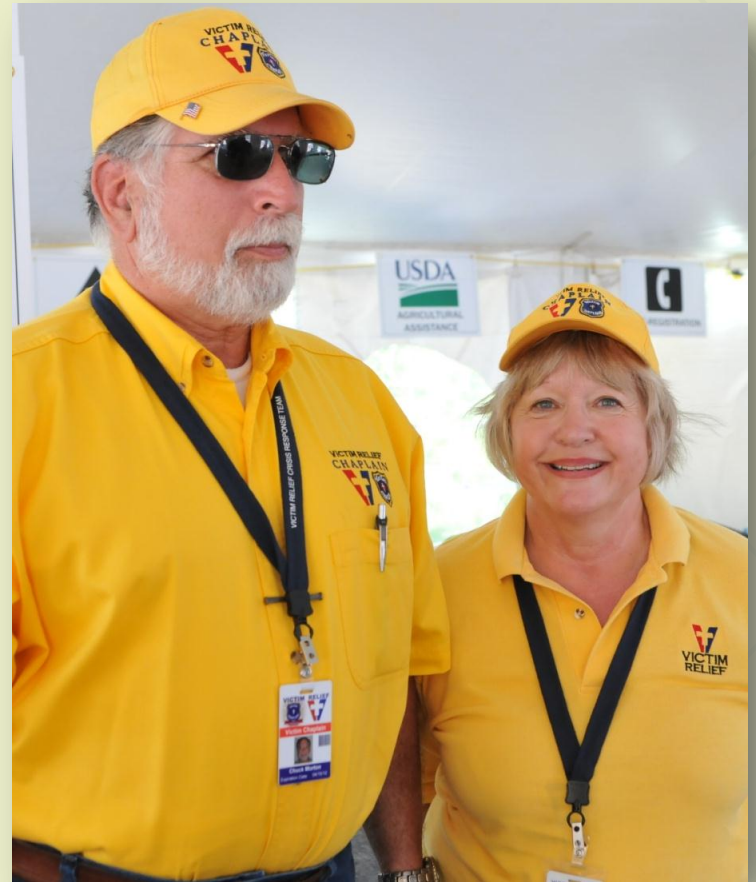
Chaplains from Victim Relief Ministries